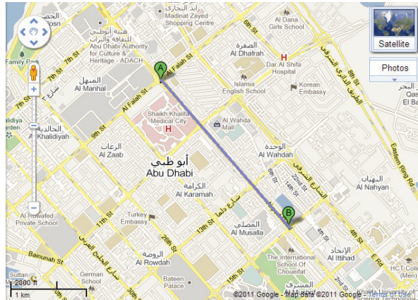
Figure 1. The Airport Road Corridor

Airport Road (from Al Falah Street with Airport Road junction to Mohamed Bin Khalifa Street with Airport Road junction), has no bus lane. It is the most important road in Abu Dhabi city. The measurements of driving cycle for buses and cars on Airport Road started from Al Falah Street with Airport Road junction to Mohamed Bin Khalifa Street with Airport Road junction. The Airport Road corridor is a dual carriageway; it has four lanes in both directions for all type of vehicles, and there is no dedicated buslane. The length of